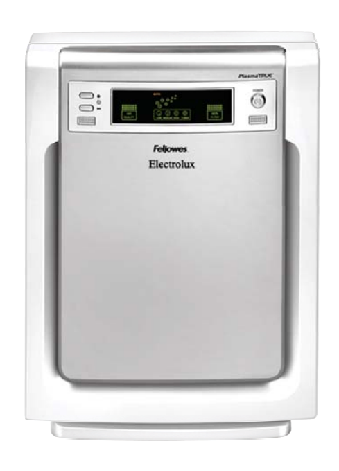
Electrolux AIR PURIFIERS FeLL Model APZ-9300