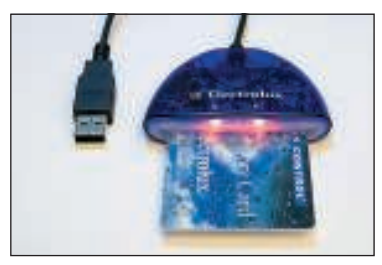
Kit No. 2 (USB) Memory Card reader for Clarus Control