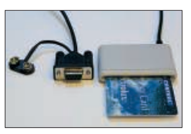
Kit No. 1 (RS232) Memory Card reader for Clarus Control